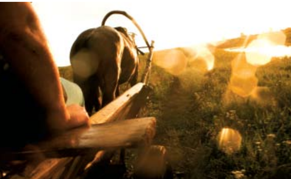
Top: Racing sperm compete for primacy in nature's ongoing effort to select the fittest. Above: Gene-related traits valued by agricultural societies may be different from those that are useful in a hustling, crowded metropolis.

base, or "letter," in the genetic alphabet. When the exact same genetic block is present in at least 20 percent of a population, according to the scientists, it indicates that something about that block has conferred a survival advantage; otherwise, it would not have become so prevalent. Because genes are reshuffled with each generation, Moyzis adds, the presence of large unchanged blocks of DNA means they were probably inherited recently. In the parlance of scientists, it is "a signature of natural selection."